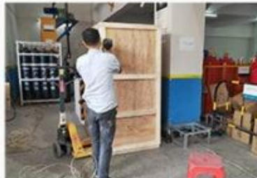
Sealing and packaging