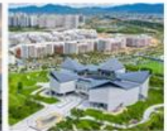
Sanya Institute of Oceanography, Ocean University of China