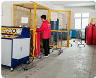
► VACUUM DISPLACEMENT