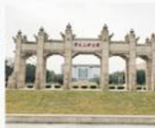
Sun Yat-sen University Gymnasium