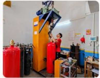
► STEEL CYLINDER ASSEMBLY