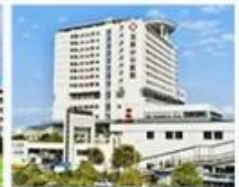
Shenzhen Longgang Central Hospital