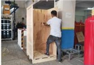
Wooden box reinforcement

Tips: The packaging method needs to be determined based on the product, and the actual product shall prevail