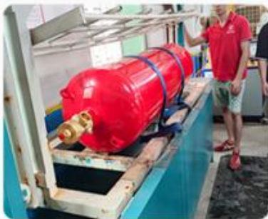
► SECONDARY AIRTIGHTNESS