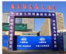
China Railway 14th Bureau Group