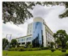
Fogang Power Supply Bureau of Guangdong Power Grid