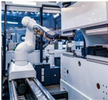
Precision Instrument Room