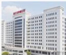
Hubei Cancer Hospital (HBCH)