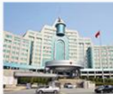
Tianjin International financial center