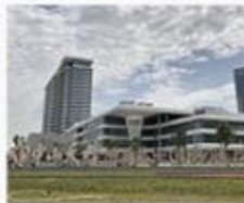
The First Affiliated Hospital of Sun Yat-sen University