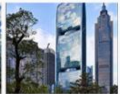
Pearl River Tower