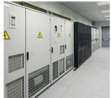
Power distribution room