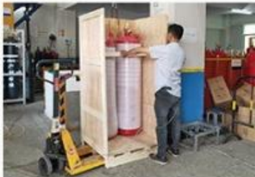
Reinforced wooden frame