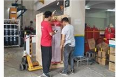
Loading gas cylinders into wooden boxes