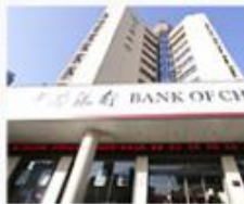
Bank of China