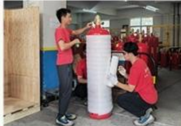
Gas cylinder packaging