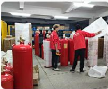
► DETECTION ACKAGING