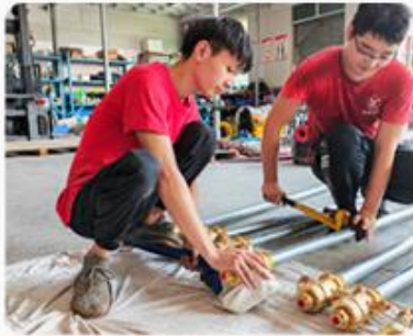
► COMPONENT DETECTION

Choose a brand manufacturer, be more confident in specifying and fill the medication in sufficient quantities production process