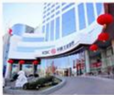
Industrial and Commercial Bank of China