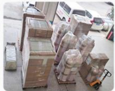
► LDETECTION ACKAGING