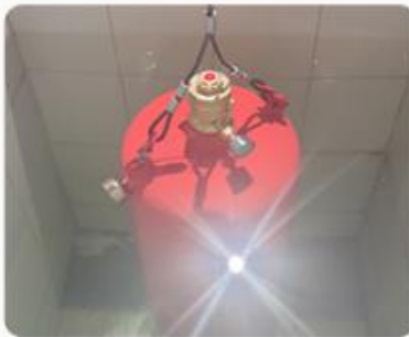
► AIRTIGHTNESS EXPERIMENT