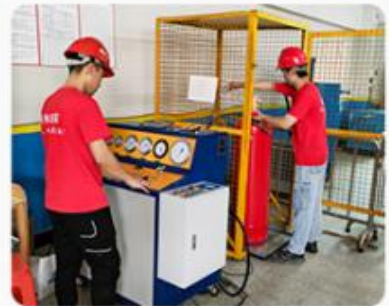
► AGENT FILLING