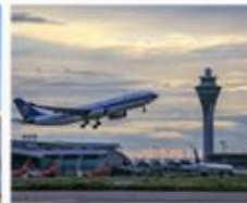
China Southern Airlines