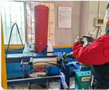
► CLEANING AND DRYING